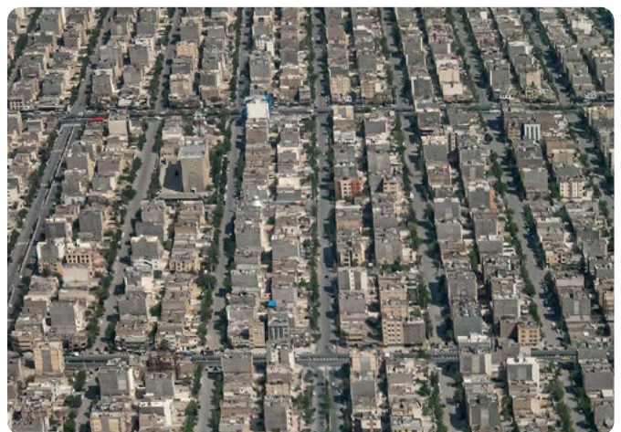
Mashhad (Iran).

This event reviewed the existing challenges facing the Mashhad Municipality in water supply and management and the use of technology and innovation in this field.