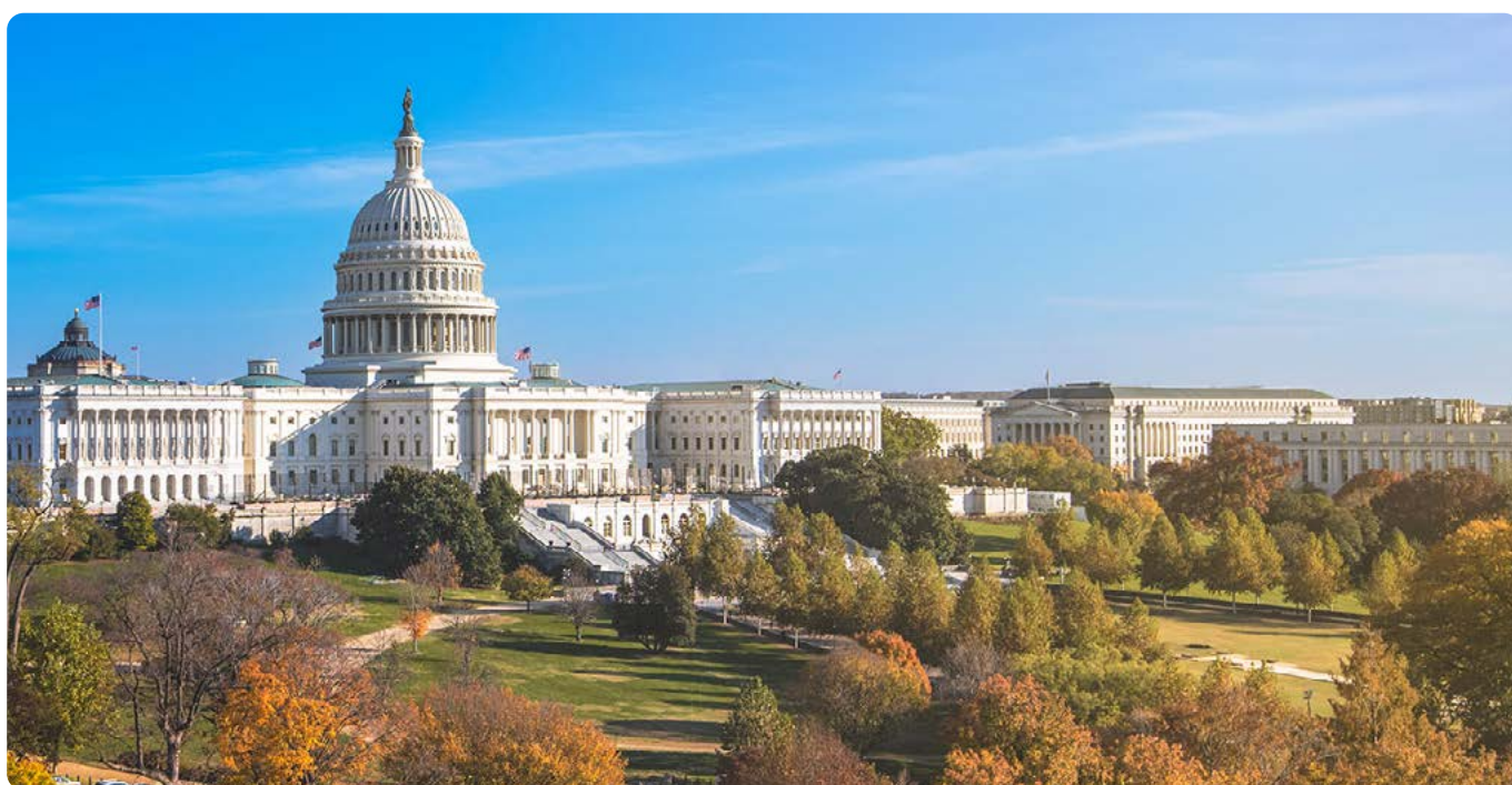
Washington (United States of America).

able urban development. Some of the main outcomes of the project include a new typology for urban forests, policy guidelines for urban forest nature-based solutions (UFNBS), an educational package for teachers and students aged 10-14 on UFNBS, and a global benchmark tool for academic literature on UFNBS.