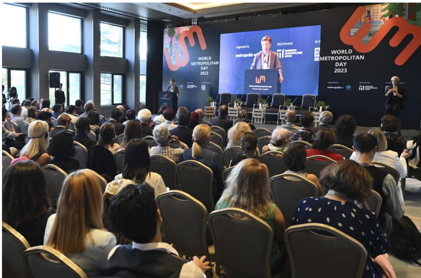
World Metropolitan Day main event in Istanbul.

The theme of this year's World Metropolitan Day was "The Power of Nature in Our Metropolises." Cities are facing many challenges, including pollution, flooding, health, and inequality. But what if we could use nature as a source of inspiration and innovation to solve these problems?