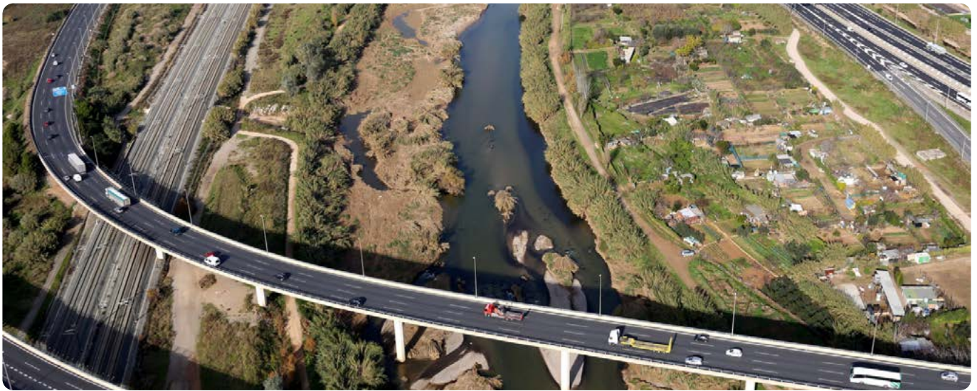
Infrastructure and Aerial View of the Llobregat River (Spain).