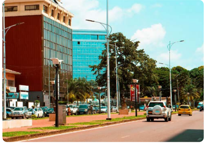
Kinshasa (Democratic Republic of the Congo).

The “Kombola Kinshasa” campaign was officially launched at the event, which aims to promote eco-citizenship for health and community resilience in Kinshasa. The campaign also involves beautifying the city with trees and flowers to conserve and restore its natural resources. This initiative shows how Kinshasa’s city authorities are creating a more sustainable and resilient city by improving its health conditions.