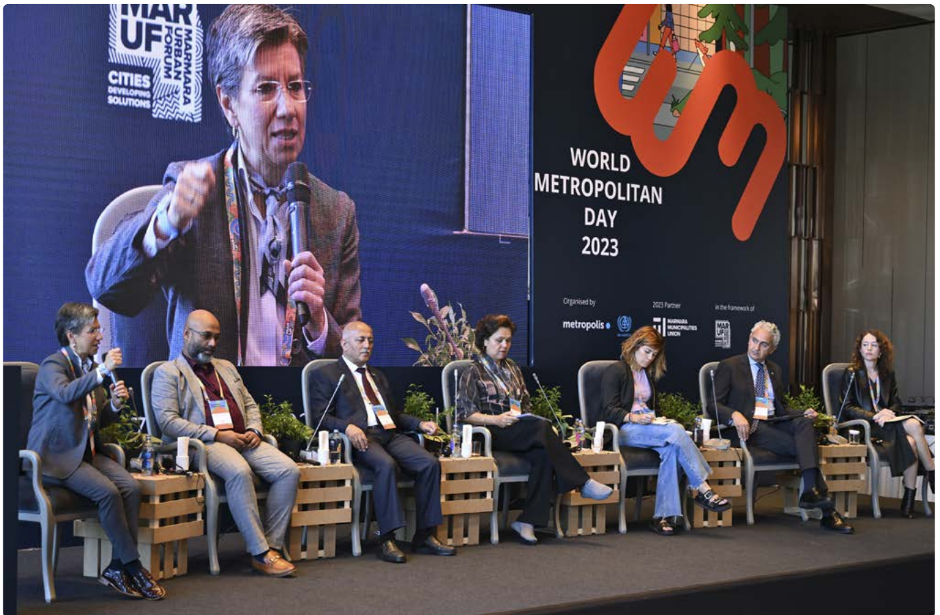
World Metropolitan Day main event in Istanbul.

On 7 October 2023, over 240 participants gathered in Istanbul, Türkiye, to celebrate World Metropolitan Day and discuss how to use nature-based solutions to transform metropolises into more liveable places. The event was hosted by the Marmara Municipalities Union in the framework of the Marmara Urban Forum (MARUF).