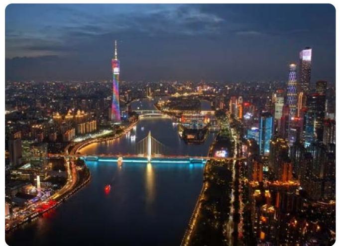
Guangzhou Canton Tower (China).

On 7 October, Guangzhou lit up the iconic Canton Tower in a display of support for World Metropolitan Day. This gesture signified the city’s commitment to the global mission of promoting sustainable metropolitan development. It showcased Guangzhou’s role as a significant participant in worldwide endeavours to address the intricate issues faced by metropolitan areas.