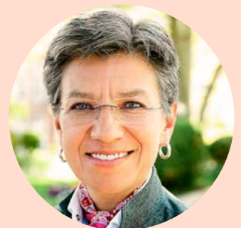
Claudia López President of Metropolis and Mayor of Bogotá

Sharing, humbleness and willingness to cooperate are what cities bring to the world. Rather than competing, cities are sharing, rather than excluding we're including. We are building solutions.